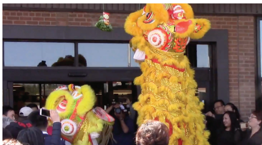
Going for the low-hanging fruit...