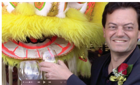
...dragon got a drink. Both dragons!