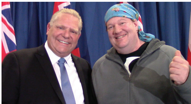
Doug Ford, Yours Truly, Barrie, May 18, 2018