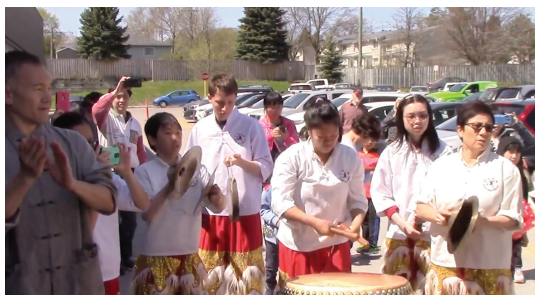
A little bit more music to close the ceremony.