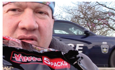
Yours Truly, hours later, reviewing Centra items in the parking lot. With my camera. And tripod. The police are on the way.