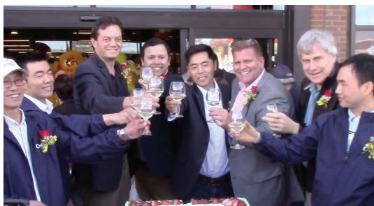
Lehman, council members, staff, make toast.