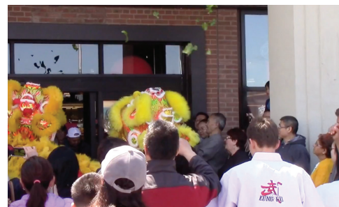
...and then throwing it all over the place.