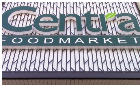
Show the logo.