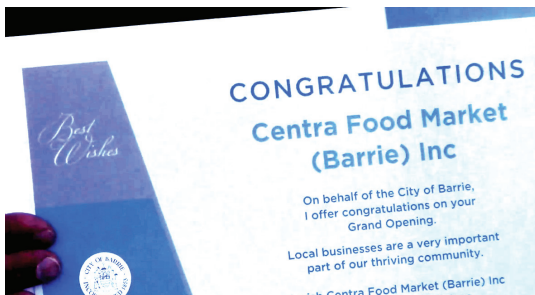
Letter from Lehman to Centra.