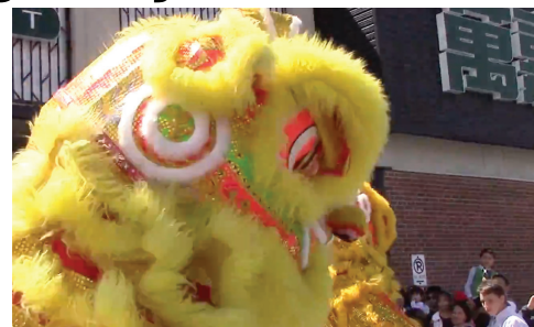
and the other one, too.