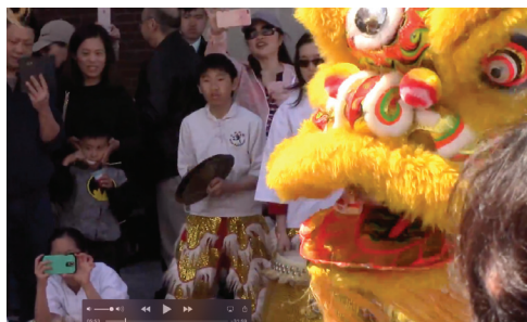
We have dragons, here!