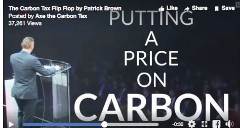
Patrick Brown in 2016, betraying his promise, calls for liberal-style carbon taxes