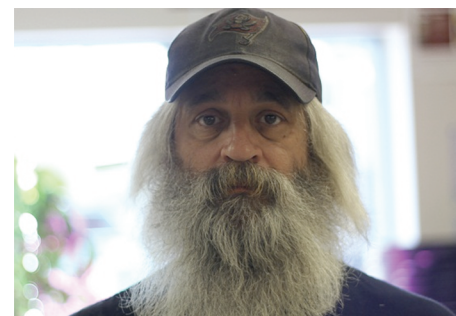
And exotic, expert advice, too

bone meal rock phosphate glacial rock dust hydroton growstone diatomaceous earth dolomitic lime and a special, ready to go promix