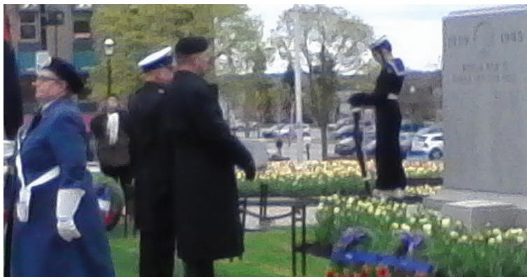
Wreath laying at Cenotaph