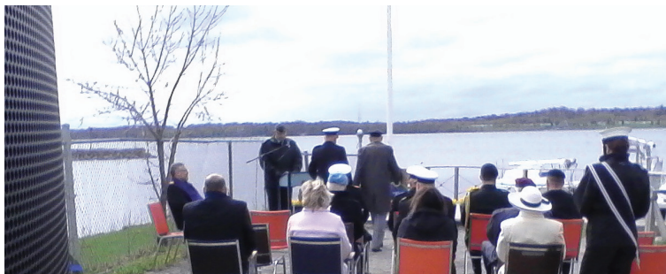
Service at Naval Memorial at waterfront