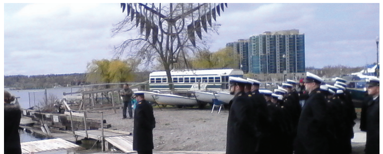
Members of the Royal Canadian Navy