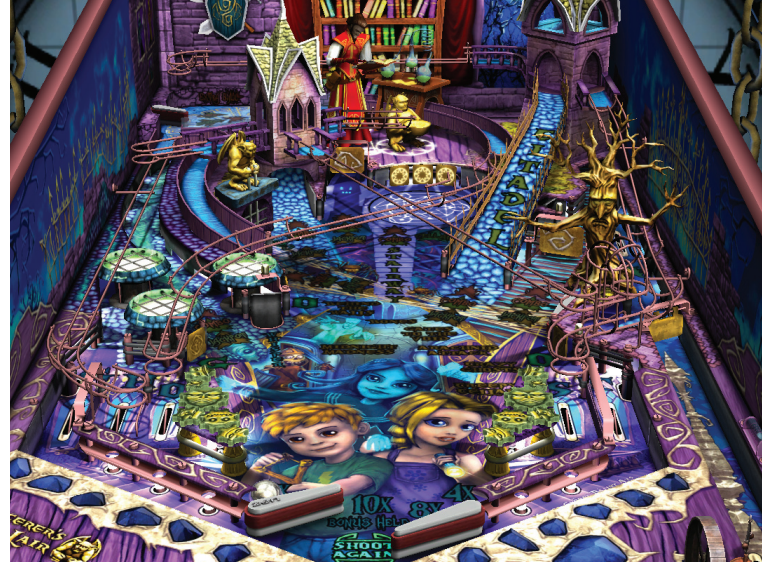
Left: Spooky talking tree. Right: Full table, from Sorcerer's Lair , by Zen Pinball

I wanted to do something for Halloween, and here it is. A bit of a review, and instructions on how to get, Sorcerer's Lair , a pinball game for the Apple Macintosh. This game came out five years ago for a bunch of platforms. I found it for no charge, here: https://zen-pinball-2.en.softonic.com/mac