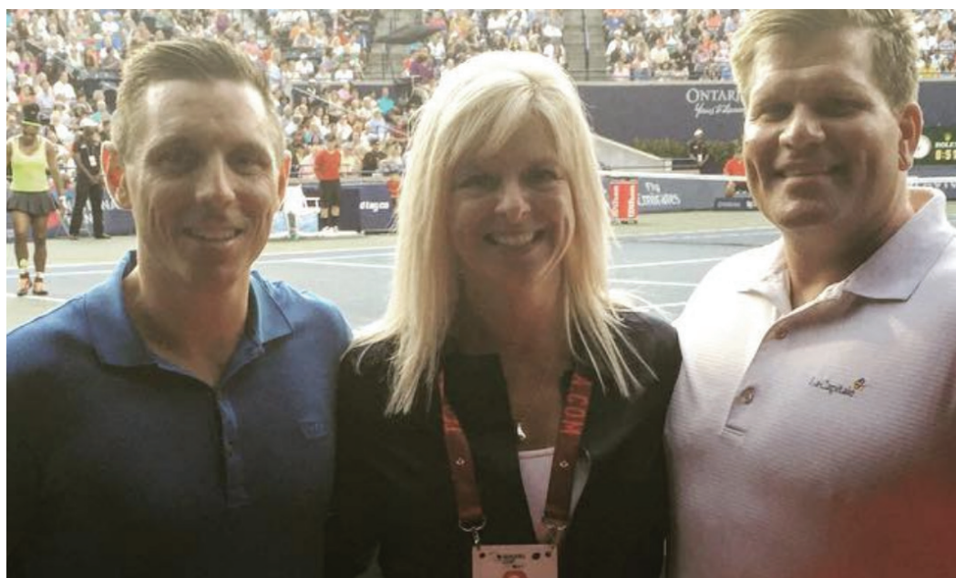
From left: The head of the snake, someone I don't know and a member of the Patrick Brown Loyalists™