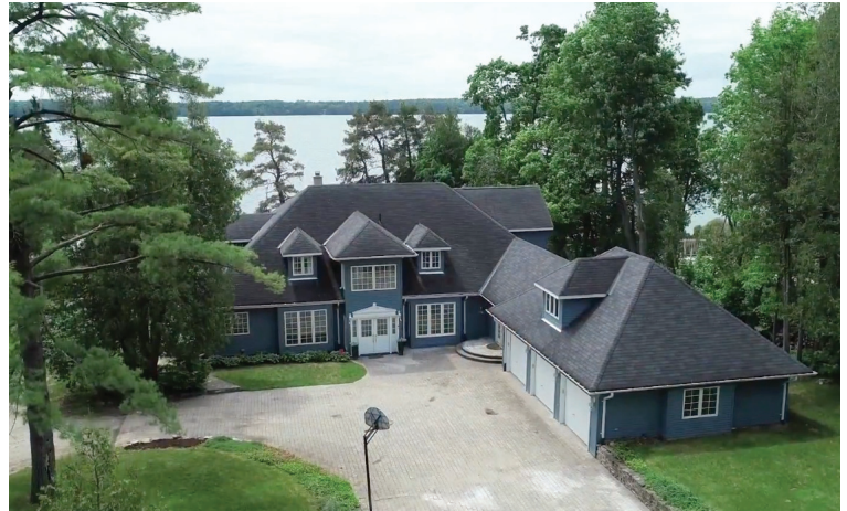
Patrick Brown's former Barrie mansion, on a private road at 3 Pemberton Lane, with a carbon footprint the size of a football field

Once he had no government gravy coming, he showed us that he never loved Barrie and that it was not his home. He lied. Brown came here for the advantages his uncle, PC MPP Joe Tascona, had waiting for him, to get started. That was all.