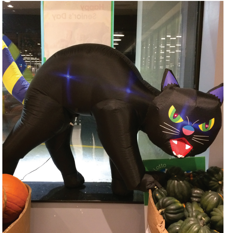
Centra Food Market, 320 Bayfield Street www.centrafoods.ca