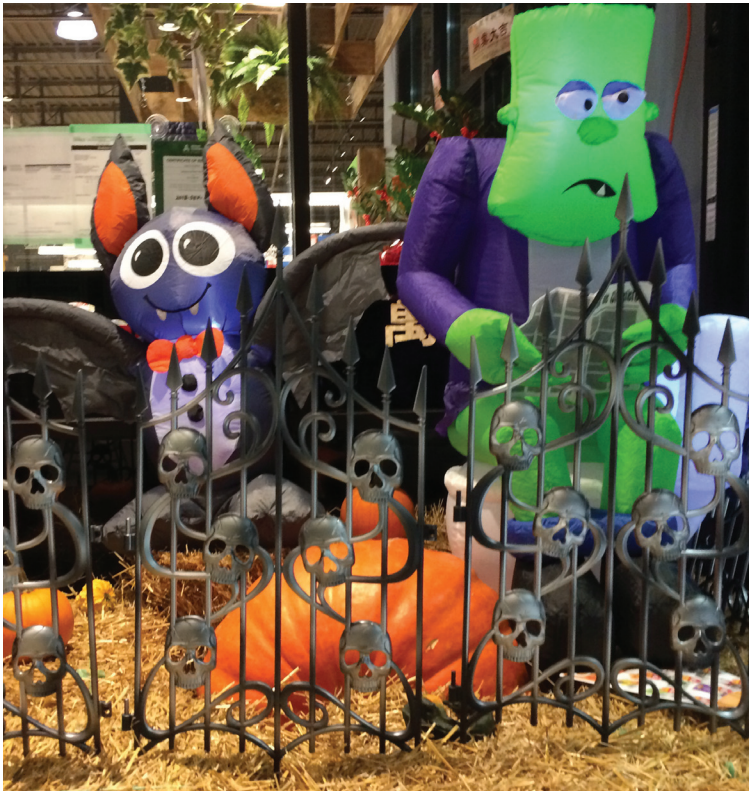
Centra Food Market, 320 Bayfield Street www.centrafoods.ca