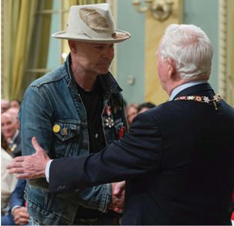
At right, Governor General David Johnston shakes hands with, at left, Gord Downie, after investing him in the Order of Canada at Rideau Hall, on June 19, 2017 in Ottawa

"The Order of Canada (French: Ordre du Canada) is a Canadian national order, admission into which is the second highest honour for merit in the system of orders, decorations, and medals of Canada. It comes second only to membership in the Order of Merit, which is the personal gift of Canada's monarch." —Wikipedia