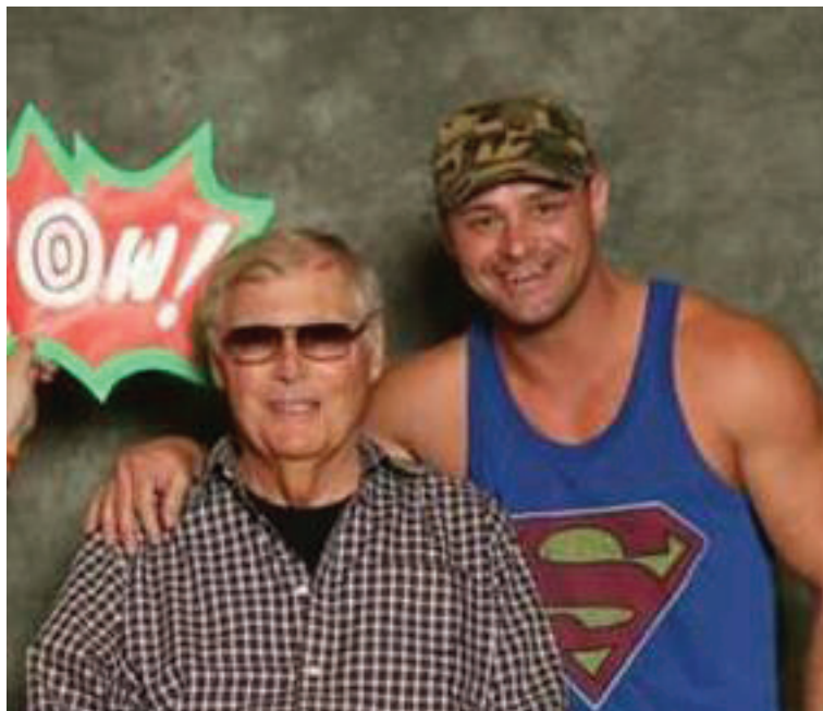
From left: Adam West, John McClane

On the 9th of this month, Adam West passed away after a brief illness. There is an official website for West, www.adamwest.com , which is a great place to visit. He was painting the last few years, and they have artwork prints available for $500.00, each.