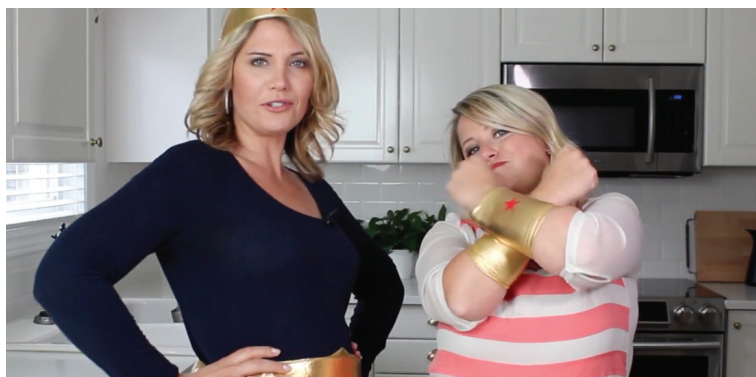
Good sports, dressing up as Wonder Woman. Funnier, is sharing one costume between them

They're local and funny, go check them out at www.tklmedia.ca .